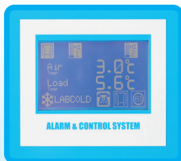
Hygienic touch screen controller

Designed and manufactured in the UK in our Basingstoke factory, this Blood Bank refrigerator is a certified Medical Device in accordance with Directive 93/42/EEC and is compliant with BS4376:Part 1:1991. This blood bank is fitted with safety features such as a seven day chart recorder to keep you in the knowledge that your product is stored correctly and safely.